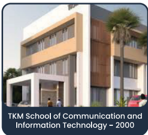
TKM School of Communication and Information Technology - 2000