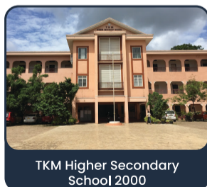
TKM Higher Secondary School - 2000