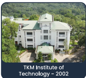
TKM Institute of Technology - 2002