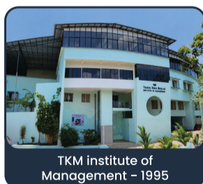
TKM Institute of Management - 1995