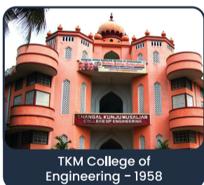
TKM College of Engineering - 1958

Established in 1995, TKM Institute of Management (TKMIM) is a distinguished institution offering a two-year full-time MBA program. Affiliated with the University of Kerala and approved by AICTE, TKMIM has consistently delivered excellence in management education for nearly three decades. With our MBA program reaccredited by the National Board of Accreditation (NBA) for three consecutive cycles since 2013, TKMIM continues to set benchmarks in academic quality and industry relevance. Recently ranked 13th among Top Private Affiliated Colleges in India by Outlook I-Care India's Best B-Schools 2024 Ranking and recognised under the Institution's Innovation Council (IIC) program by the Ministry of Education, we remain committed to nurturing future-ready leaders.