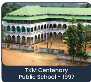
TKM Centenary Public School - 1997