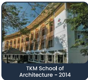
TKM School of Architecture - 2014