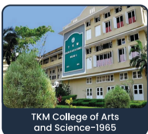
TKM College of Arts and Science - 1965