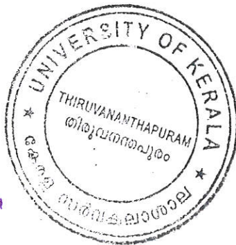
DIRECTOR TKM Institute of Management Musaliar Hills, Karuvelil P.O., Kollam - 691 505